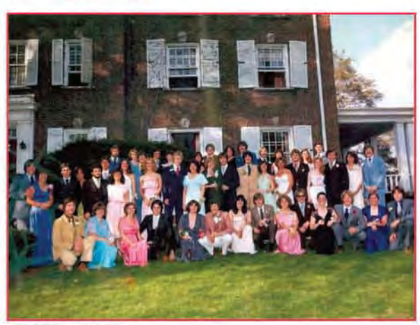
1980 Spring Formal

Photos from your days as an undergraduate or recent alumni gathering